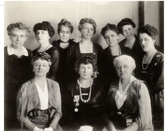
Board of Directors National League of Women Voters Chicago Convention, February 1920